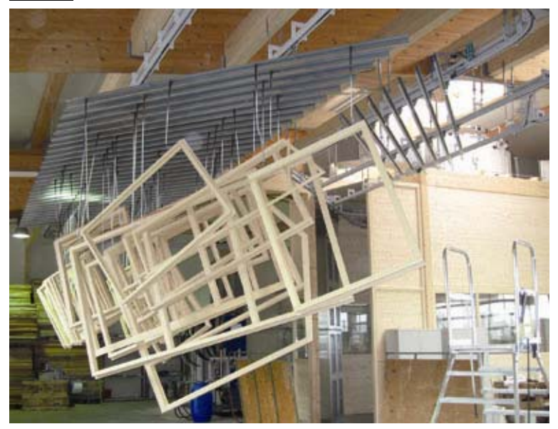
Caption: The Power & Free system of Conductix-Wampfler is used, among other things, in coating plants for wooden window-frames. Minimal space is needed due to transverse buffering.